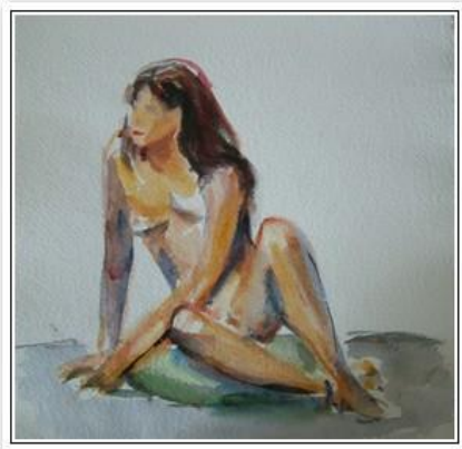
Contemplation 8x10 by K.A. McMahon