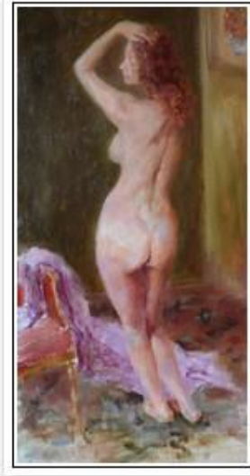
In the Boudoir 30x16 by Janelle Cox