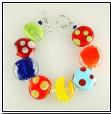
Bracelet - Lollipop Fruit Salad