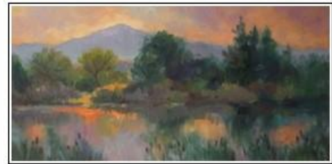
"The Last 10 Minutes of Light" oil by Laura Reilly