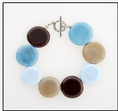
Bracelet - Oasis Solid Lollipop