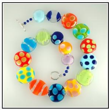
Necklace - Lollipop Fruit Salad