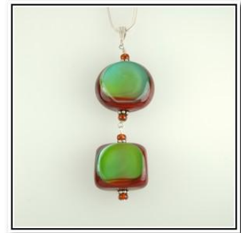
Pendant - Mystic Lime Green