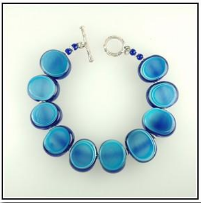
Bracelet - Cobalt