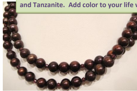
Classic Chocolate Pearls and Garnets by Ronee DelBianco Designs