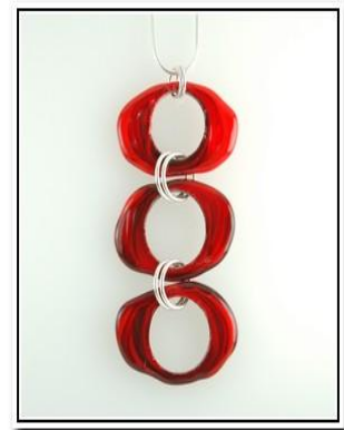
Necklace, Mod Raspberry