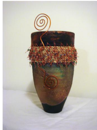
Queen of the Nile