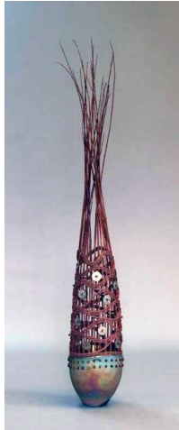
Eastern Glows 37x5.5