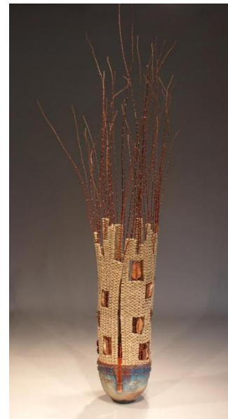
City Park 54x18