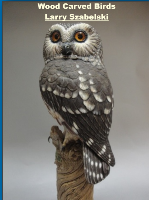
Wood Carved Birds Larry Szabelski