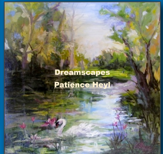
Dreamscapes Patience Heyl

Need It Gift Wrapped? Shipped? Just Ask!