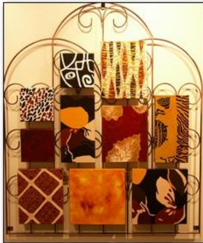
Chitenge Gate to Hope by Marlene Kort 10 individual paintings combined on a gate, 10x10 to 6x6 acrylic on canvas Silent Auction "Paintings for Change"