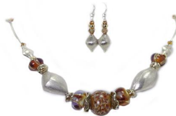
Silver, Crystals & Glass Beads Gina St. Aubin Designs