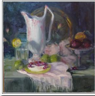
10 O'clock Brunch 18x18 oil Janelle Cox