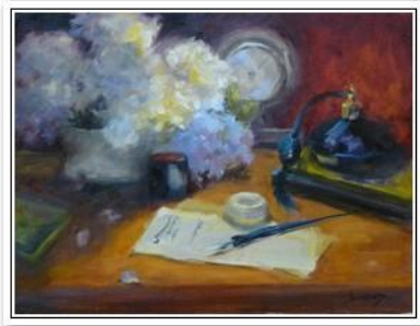
Ten Love Letters 12x16 oil Janelle Cox