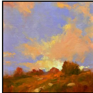
Evening Interlude 10x10 oil Don Hamilton