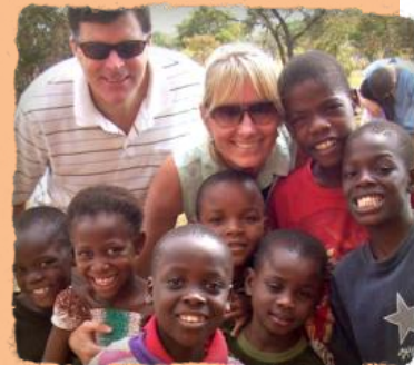
A Promise to Help